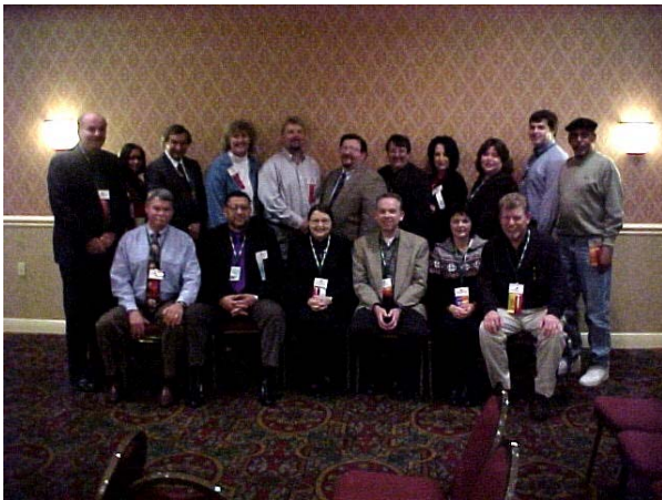
The 2003-04 LEHA Board